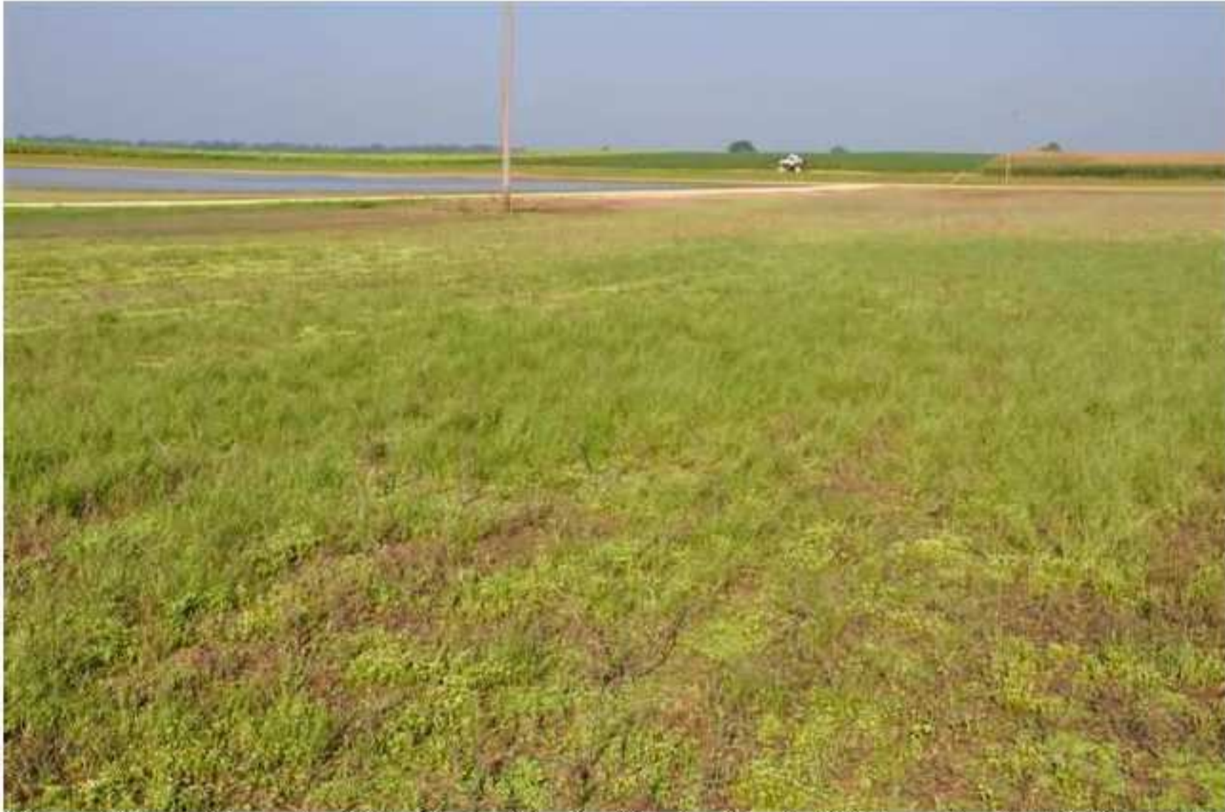
Figure 4. Same site, north of John Young Road, with mixed stand of Schoenoplectus hallii (mostly) and Echinodorus tenellus .